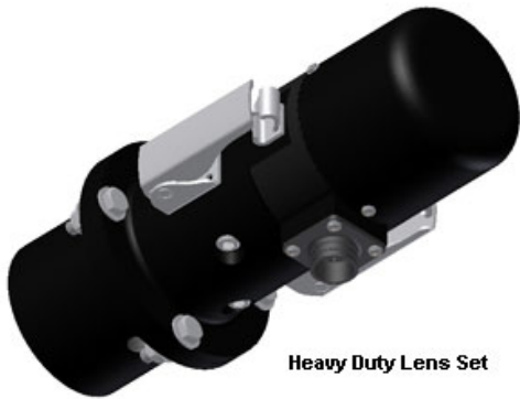
Heavy Duty Lens Set