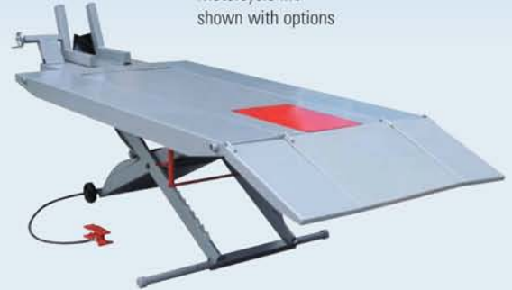
M-1000C Motorcycle lift shown with options