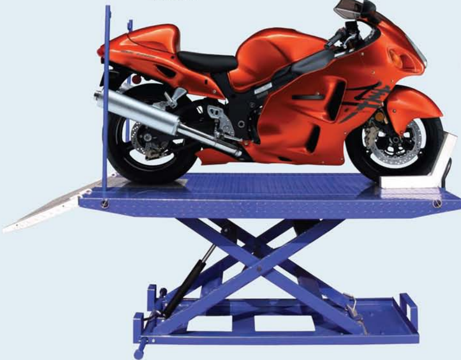
M-1500C-HR Motorcycle lift shown with standard accessories

These lift tables are ideal for making repairs to motorcycles, snowmobiles, ATVs, jet skis, etc. Choose from a range of accessories to customize these tables for your shop.